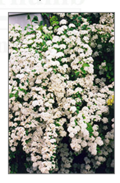
Vanhoutte Spirea flowers