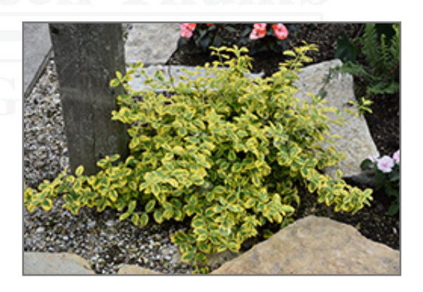
Gold Splash Wintercreeper