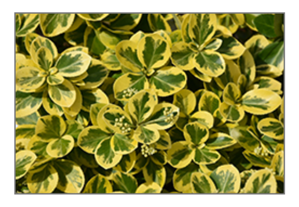
Gold Splash Wintercreeper flower buds

Gold Splash Wintercreeper will grow to be about 24 inches tall at maturity, with a spread of 12 feet. It tends to fill out right to the ground and therefore doesn't necessarily require facer plants in front. It grows at a fast rate, and under ideal conditions can be expected to live for approximately 30 years.