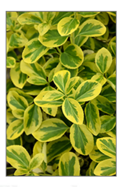
Gold Splash Wintercreeper foliage