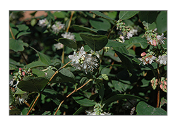
Snowberry flowers

This shrub performs well in both full sun and full shade. It is very adaptable to both dry and moist locations, and should do just fine under average home landscape conditions. It is not particular as to soil type or pH. It is somewhat tolerant of urban pollution. This species is native to parts of North America.