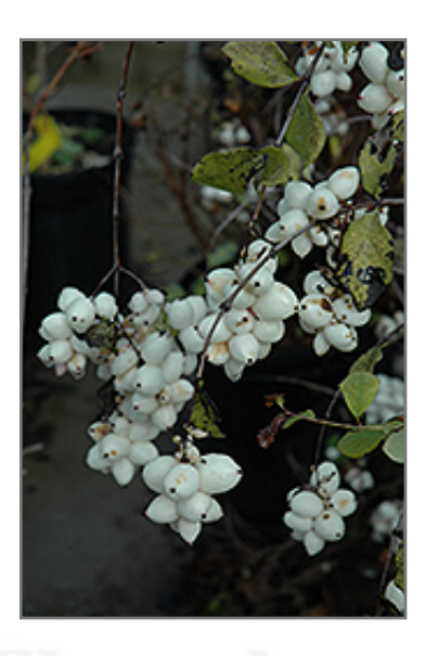
Snowberry fruit