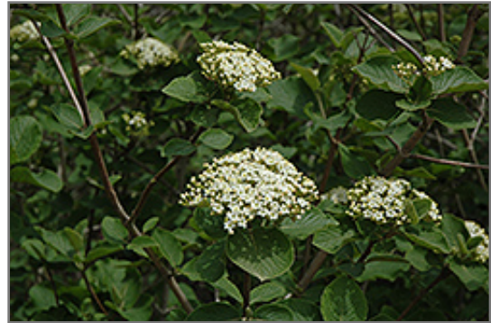
Wayfaring Tree flowers

Wayfaring Tree is a multi-stemmed deciduous shrub with a more or less rounded form. Its relatively coarse texture can be used to stand it apart from other landscape plants with finer foliage.