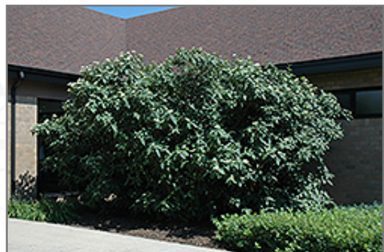
Wayfaring Tree