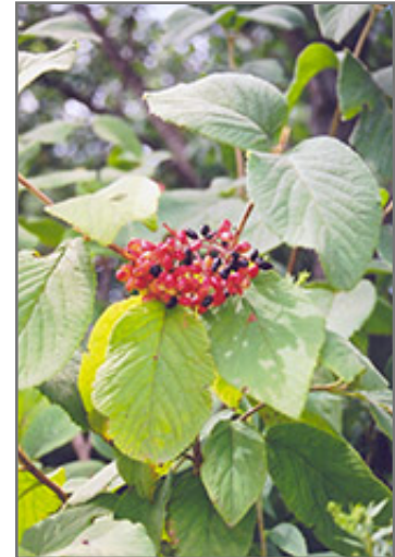
Wayfaring Tree fruit

This shrub does best in full sun to partial shade. It is very adaptable to both dry and moist locations, and should do just fine under average home landscape conditions. It is not particular as to soil type or pH. It is highly tolerant of urban pollution and will even thrive in inner city environments. This species is not originally from North America.