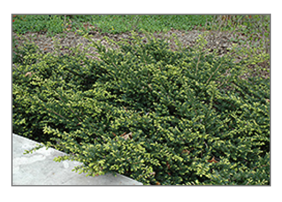
Everlow Yew

Everlow Yew is recommended for the following landscape applications;