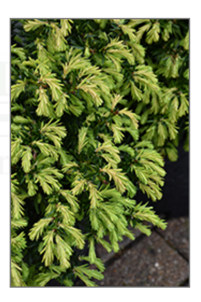
Everlow Yew foliage