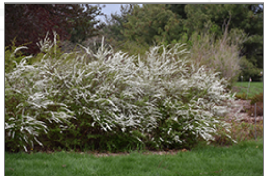
Grefsheim Spirea in bloom