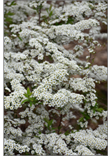
Grefsheim Spirea flowers

Grefsheim Spirea is recommended for the following landscape applications;