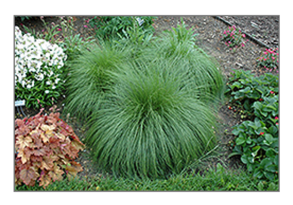
Prairie Dropseed

Prairie Dropseed is an open herbaceous perennial with a shapely form and gracefully arching foliage. It brings an extremely fine and delicate texture to the garden composition and should be used to full effect.