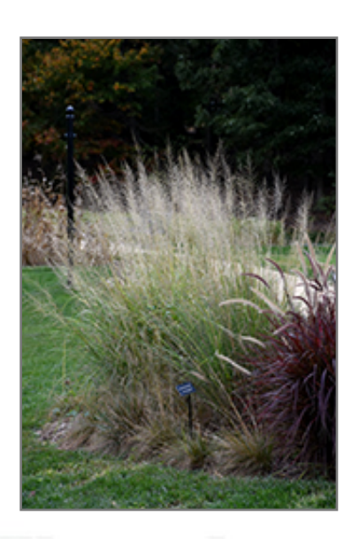
Prairie Dropseed fruit

Prairie Dropseed will grow to be about 24 inches tall at maturity extending to 3 feet tall with the flowers, with a spread of 3 feet. Its foliage tends to remain dense right to the ground, not requiring facer plants in front. It grows at a medium rate, and under ideal conditions can be expected to live for approximately 10 years. As an herbaceous perennial, this plant will usually die back to the crown each winter, and will regrow from the base each spring. Be careful not to disturb the crown in late winter when it may not be readily seen!