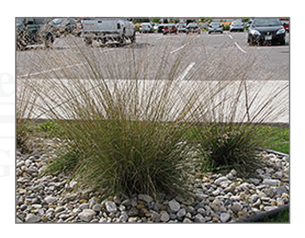
Prairie Dropseed