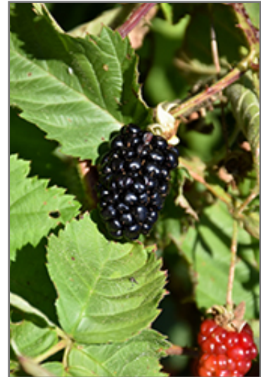
Chester Thornless Blackberry fruit