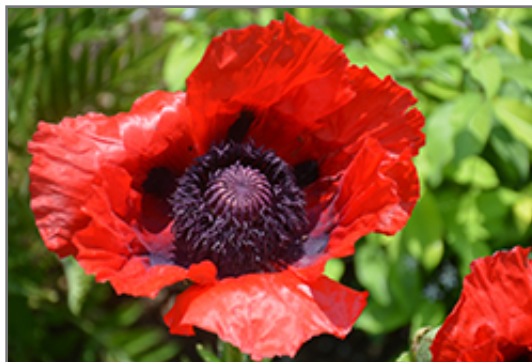
Beauty of Livermere Poppy flowers