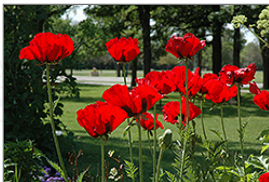
Beauty of Livermere Poppy flowers