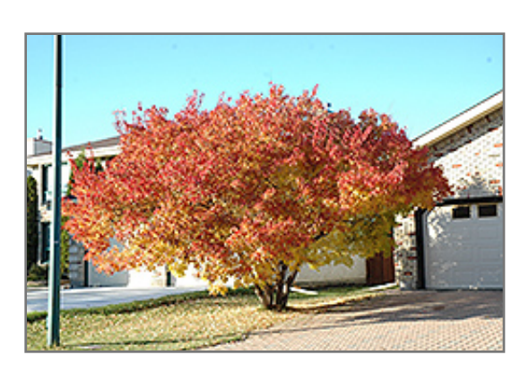
Amur Maple (multi-stem) in fall

This is a relatively low maintenance tree, and should only be pruned in summer after the leaves have fully developed, as it may 'bleed' sap if pruned in late winter or early spring. It has no significant negative characteristics.