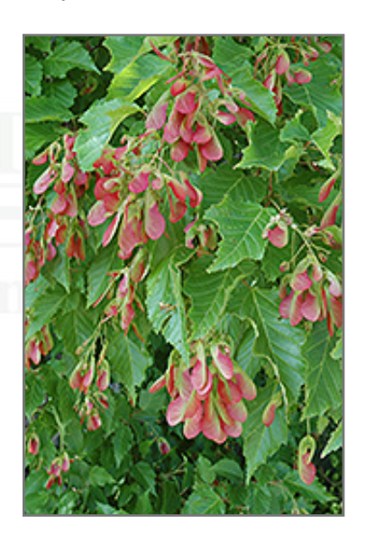
Amur Maple (multi-stem) fruit

Amur Maple (multi-stem) is recommended for the following landscape applications;