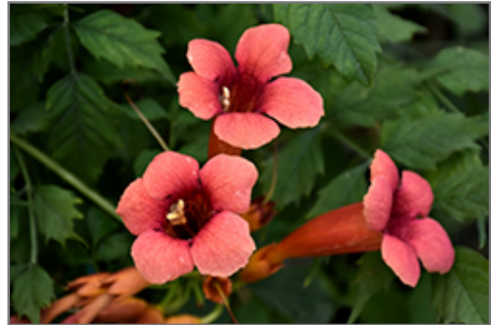
Flamenco Trumpetvine flowers

Flamenco Trumpetvine is a dense multi-stemmed deciduous woody vine with a twining and trailing habit of growth. Its average texture blends into the landscape, but can be balanced by one or two finer or coarser trees or shrubs for an effective composition.