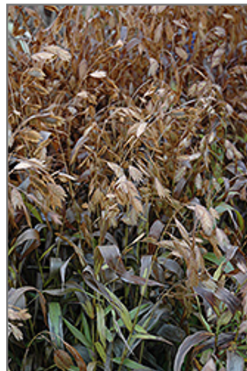
Northern Sea Oats in fall

This is a relatively low maintenance plant, and is best cleaned up in early spring before it resumes active growth for the season. It has no significant negative characteristics.