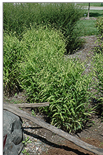
Northern Sea Oats