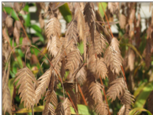
Northern Sea Oats fruit

Northern Sea Oats will grow to be about 4 feet tall at maturity, with a spread of 30 inches. Its foliage tends to remain dense right to the ground, not requiring facer plants in front. It grows at a medium rate, and under ideal conditions can be expected to live for approximately 10 years. As an herbaceous perennial, this plant will usually die back to the crown each winter, and will regrow from the base each spring. Be careful not to disturb the crown in late winter when it may not be readily seen!