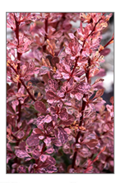
Rose Glow Japanese Barberry foliage

Rose Glow Japanese Barberry is a dense multi-stemmed deciduous shrub with a more or less rounded form. Its relatively fine texture sets it apart from other landscape plants with less refined foliage.