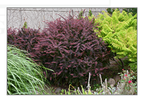
Rose Glow Japanese Barberry