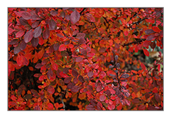
Rose Glow Japanese Barberry in fall