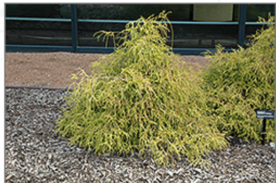
Sungold Falsecypress