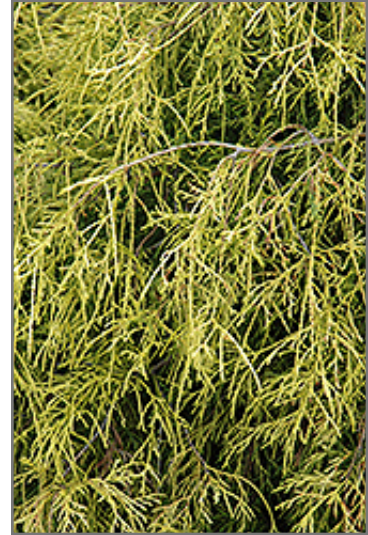
Sungold Falsecypress foliage

This is a relatively low maintenance shrub. When pruning is necessary, it is recommended to only trim back the new growth of the current season, other than to remove any dieback. It has no significant negative characteristics.