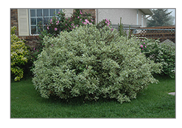
Ivory Halo Dogwood

This is a relatively low maintenance shrub, and can be pruned at anytime. It has no significant negative characteristics.