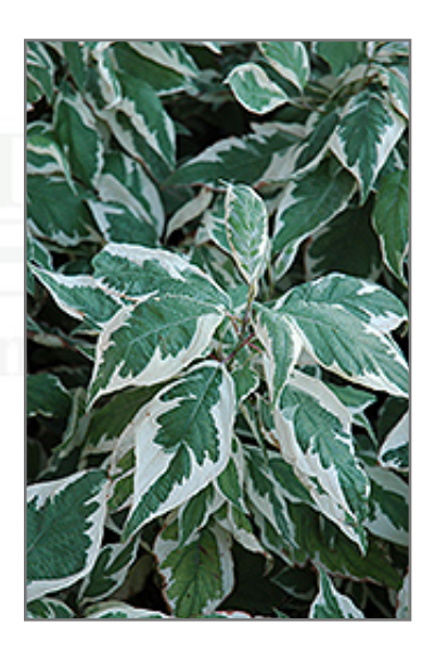
Ivory Halo Dogwood foliage

Ivory Halo Dogwood is recommended for the following landscape applications;