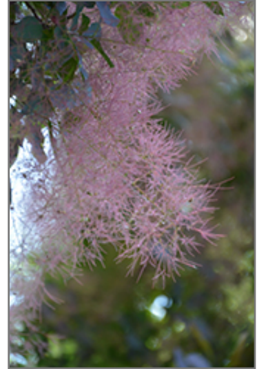
Royal Purple Smokebush flowers

This shrub should only be grown in full sunlight. It is very adaptable to both dry and moist locations, and should do just fine under average home landscape conditions. It is not particular as to soil type or pH. It is highly tolerant of urban pollution and will even thrive in inner city environments, and will benefit from being planted in a relatively sheltered location. This is a selected variety of a species not originally from North America.