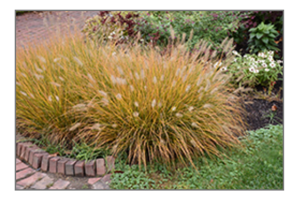
Hameln Dwarf Fountain Grass in fall

This is a relatively low maintenance plant, and is best cleaned up in early spring before it resumes active growth for the season. Deer don't particularly care for this plant and will usually leave it alone in favor of tastier treats. It has no significant negative characteristics.