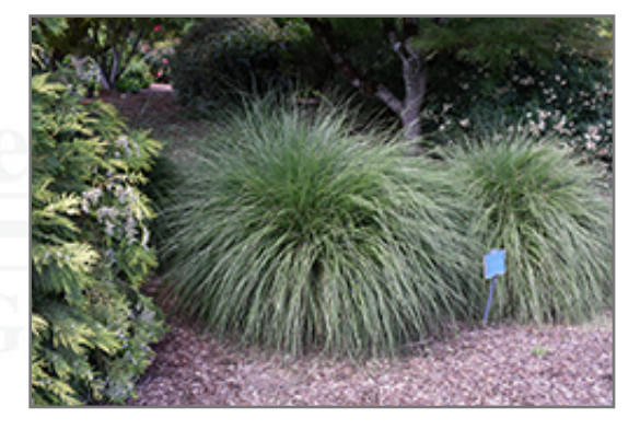
Hameln Dwarf Fountain Grass