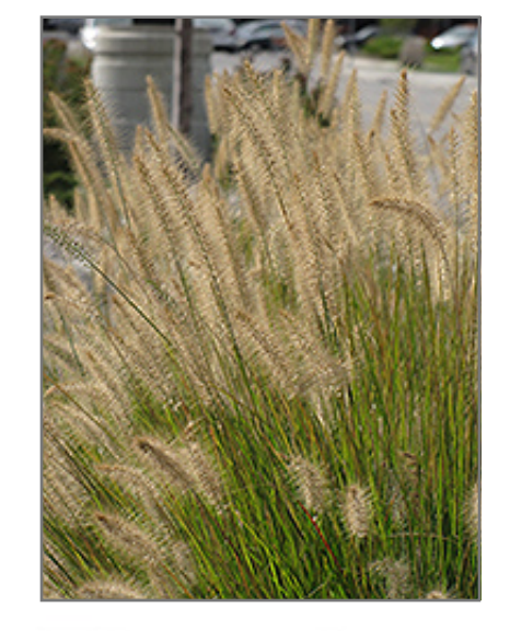
Hameln Dwarf Fountain Grass flowers

This plant should only be grown in full sunlight. It is very adaptable to both dry and moist growing conditions, but will not tolerate any standing water. It is considered to be drought-tolerant, and thus makes an ideal choice for a low-water garden or xeriscape application. It is not particular as to soil type or pH. It is somewhat tolerant of urban pollution. This is a selected variety of a species not originally from North America.