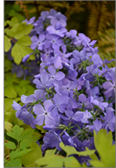
Blue Moon Phlox flowers