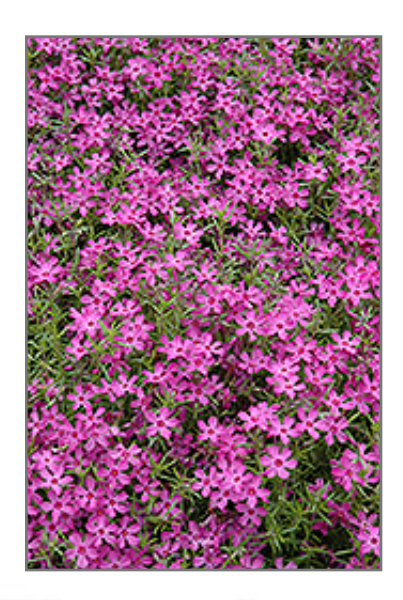
Crimson Beauty Moss Phlox flowers

Crimson Beauty Moss Phlox is a dense herbaceous evergreen perennial with a ground-hugging habit of growth. It brings an extremely fine and delicate texture to the garden composition and should be used to full effect.