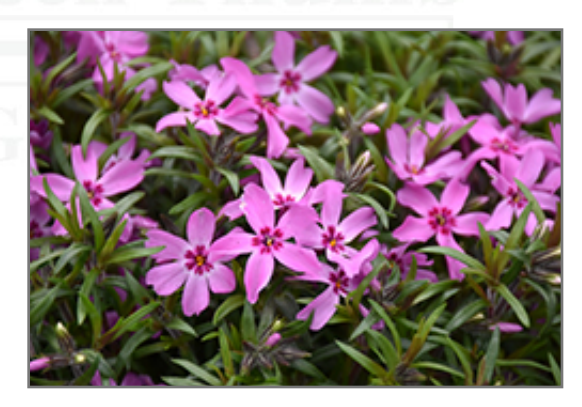
Crimson Beauty Moss Phlox flowers