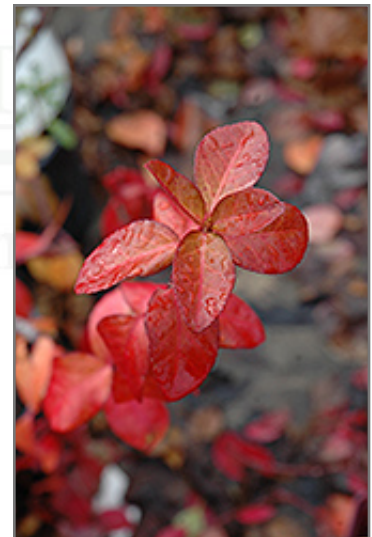
Purpleleaf Wintercreeper in fall