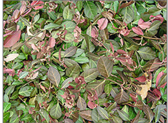
Purpleleaf Wintercreeper foliage