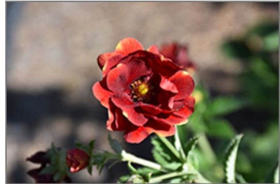
Arc En Ciel Cinquefoil flowers

Arc En Ciel Cinquefoil is recommended for the following landscape applications;