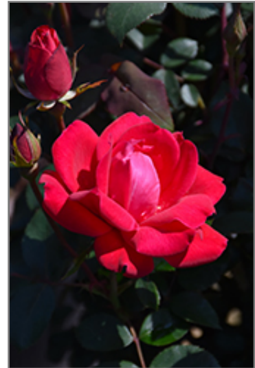
Double Knock Out Rose flowers