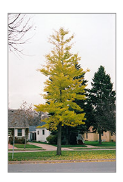
Princeton Sentry Ginkgo in fall

This tree should only be grown in full sunlight. It is very adaptable to both dry and moist locations, and should do just fine under average home landscape conditions. It is not particular as to soil type or pH, and is able to handle environmental salt. It is highly tolerant of urban pollution and will even thrive in inner city environments. Consider applying a thick mulch around the root zone in winter to protect it in exposed locations or colder microclimates. This is a selected variety of a species not originally from North America.