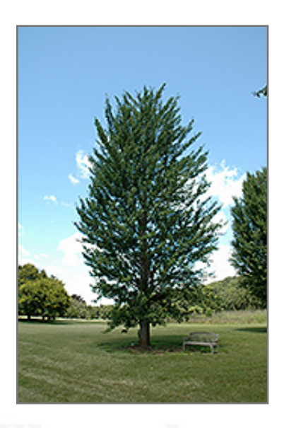
Princeton Sentry Ginkgo

This is a relatively low maintenance tree, and is best pruned in late winter once the threat of extreme cold has passed. Deer don't particularly care for this plant and will usually leave it alone in favor of tastier treats. It has no significant negative characteristics.