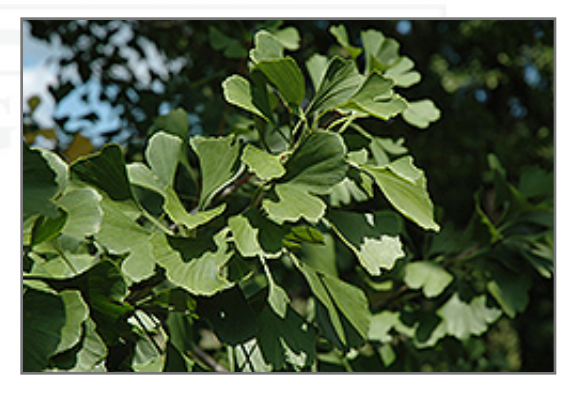
Princeton Sentry Ginkgo foliage