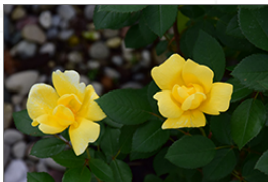
Sunny Knock Out Rose flowers