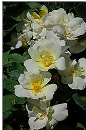
Sunny Knock Out Rose flowers

Sunny Knock Out Rose is a multi-stemmed deciduous shrub with a more or less rounded form. Its average texture blends into the landscape, but can be balanced by one or two finer or coarser trees or shrubs for an effective composition.