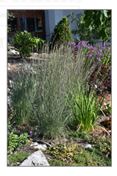
Little Bluestem in bloom