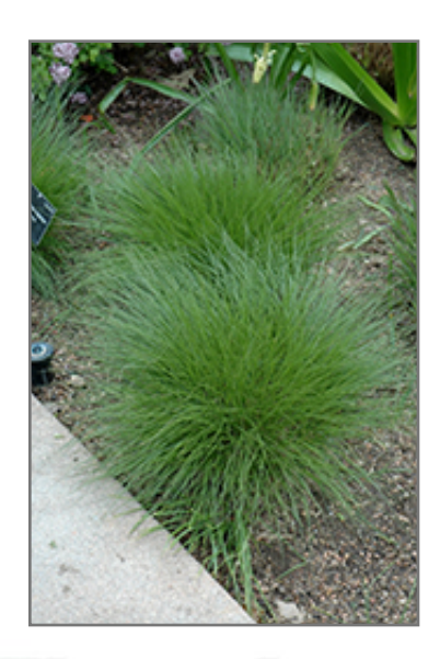
Little Bluestem

Little Bluestem is recommended for the following landscape applications;