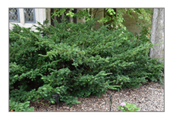
Ward's Yew

Ward's Yew is recommended for the following landscape applications;