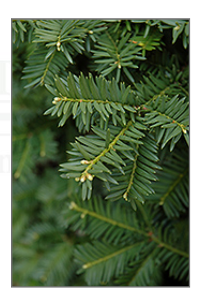
Ward's Yew foliage