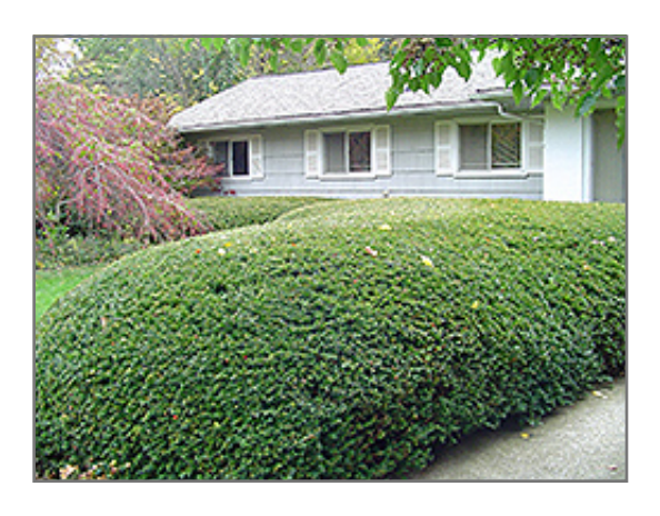
Ward's Yew

This shrub performs well in both full sun and full shade. However, you may want to keep it away from hot, dry locations that receive direct afternoon sun or which get reflected sunlight, such as against the south side of a white wall. It does best in average to evenly moist conditions, but will not tolerate standing water. It is not particular as to soil type or pH. It is highly tolerant of urban pollution and will even thrive in inner city environments, and will benefit from being planted in a relatively sheltered location. Consider applying a thick mulch around the root zone in winter to protect it in exposed locations or colder microclimates. This particular variety is an interspecific hybrid, and parts of it are known to be toxic to humans and animals, so care should be exercised in planting it around children and pets.