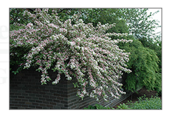
Dwarf Variegated Weigela in bloom

Dwarf Variegated Weigela is recommended for the following landscape applications;