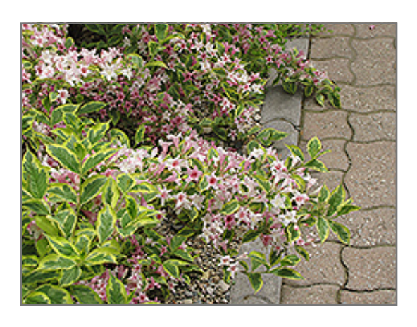
Dwarf Variegated Weigela flowers

This shrub will require occasional maintenance and upkeep, and should only be pruned after flowering to avoid removing any of the current season's flowers. It is a good choice for attracting hummingbirds to your yard. It has no significant negative characteristics.