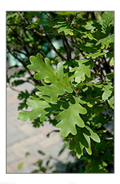
Crimson Spire Oak foliage

This tree should only be grown in full sunlight. It is very adaptable to both dry and moist locations, and should do just fine under average home landscape conditions. It is not particular as to soil type or pH. It is highly tolerant of urban pollution and will even thrive in inner city environments. This particular variety is an interspecific hybrid.