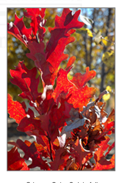
Crimson Spire Oak in fall