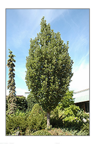
Crimson Spire Oak