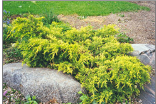
Gold Coast Juniper