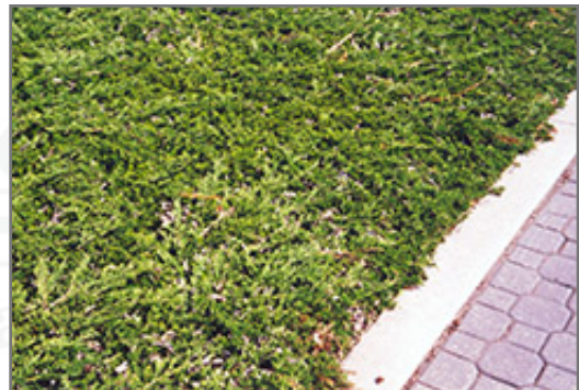
Prince of Wales Juniper