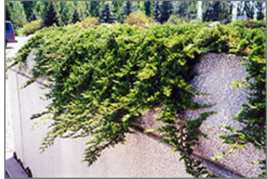
Prince of Wales Juniper

Prince of Wales Juniper is recommended for the following landscape applications;