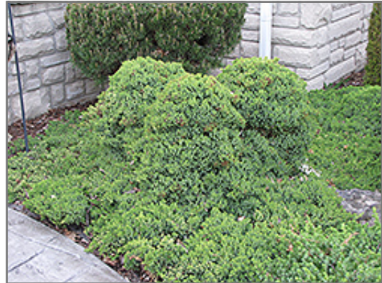
Dwarf Japgarden Juniper

Dwarf Japgarden Juniper is recommended for the following landscape applications;