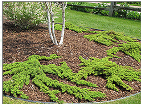
Dwarf Japgarden Juniper