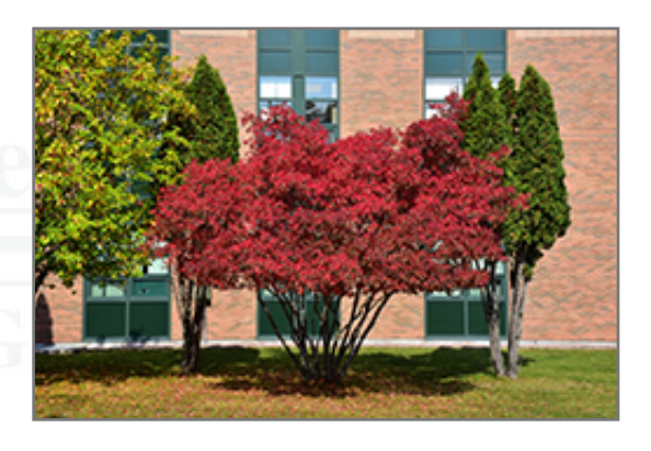
Amur Maple in fall