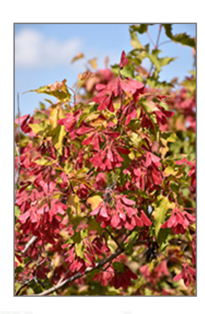
Amur Maple fruit

This tree does best in full sun to partial shade. It is very adaptable to both dry and moist locations, and should do just fine under average home landscape conditions. It is not particular as to soil type or pH. It is highly tolerant of urban pollution and will even thrive in inner city environments. This species is not originally from North America.