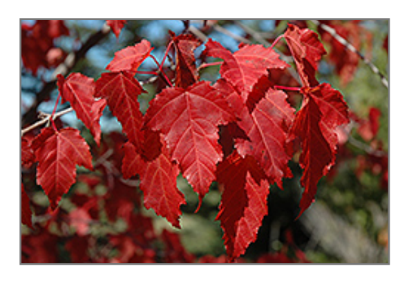
Amur Maple in fall

Amur Maple is recommended for the following landscape applications;