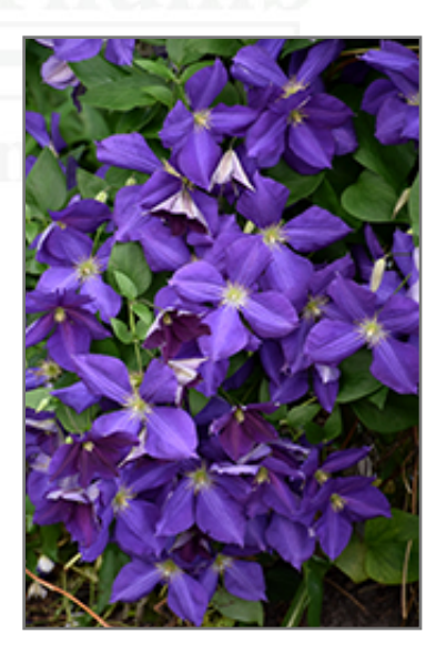
Jackmanii Clematis flowers