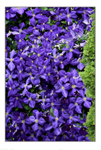
Jackmanii Clematis in bloom

Jackmanii Clematis is recommended for the following landscape applications;