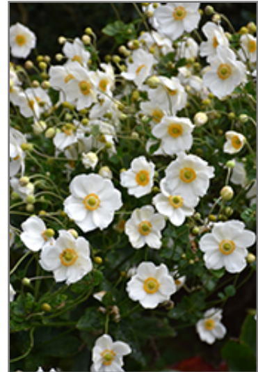
Honorine Jobert Anemone flowers

Honorine Jobert Anemone is recommended for the following landscape applications;