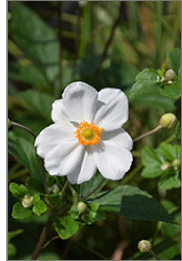
Honorine Jobert Anemone flowers

This plant does best in full sun to partial shade. It prefers to grow in average to moist conditions, and shouldn't be allowed to dry out. It is not particular as to soil type or pH. It is somewhat tolerant of urban pollution. This particular variety is an interspecific hybrid. It can be propagated by division; however, as a cultivated variety, be aware that it may be subject to certain restrictions or prohibitions on propagation.