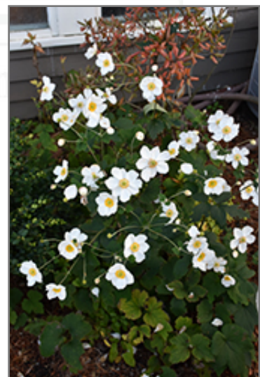
Honorine Jobert Anemone in bloom