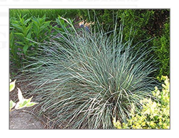
Sapphire Blue Oat Grass