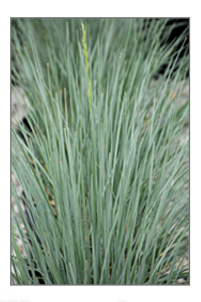
Sapphire Blue Oat Grass foliage