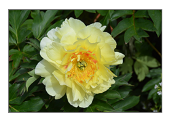
Bartzella Peony flowers

Bartzella Peony is an herbaceous perennial with a more or less rounded form. Its medium texture blends into the garden, but can always be balanced by a couple of finer or coarser plants for an effective composition.