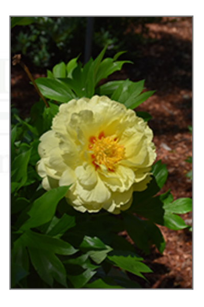
Bartzella Peony flowers