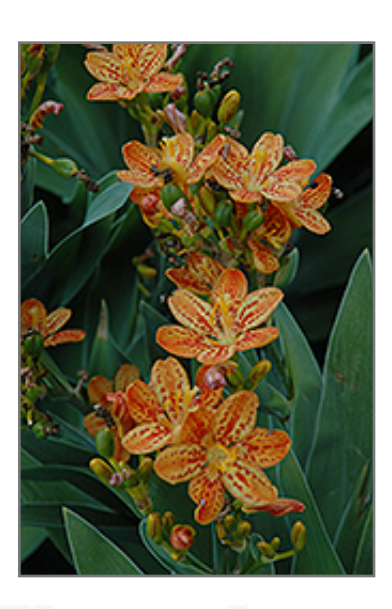
Freckle Face Blackberry Lily flowers

Tall spikes topped with stunning orange-yellow flowers freckled with red spots; followed later by blackberry-like seed pods in summer; breathtaking in when planted in masses; sword-like foliage resembles that of an iris