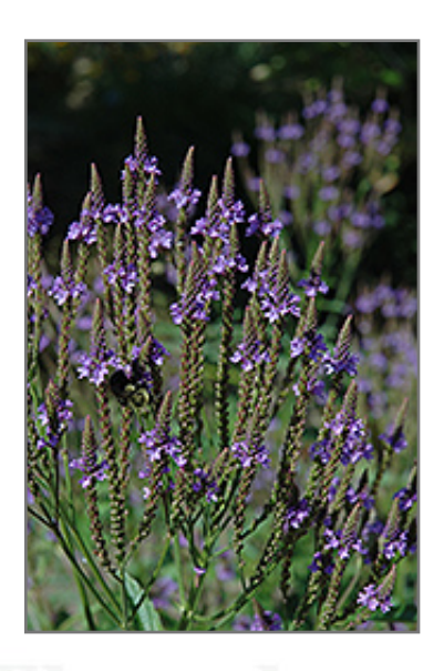
Blue Verbena flowers

Blue Verbena is recommended for the following landscape applications;