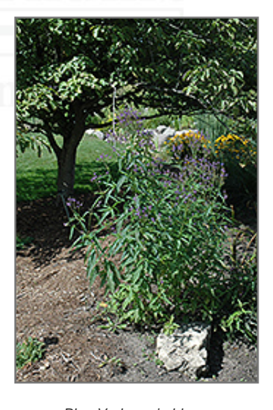
Blue Verbena in bloom