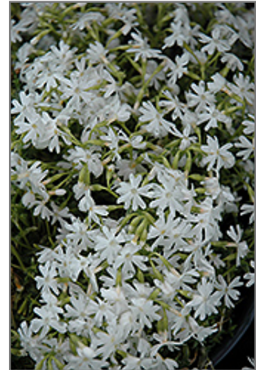
Snowflake Phlox flowers

This variety produces a showy carpet of bright white flowers shining in the spring sun; prune lightly after flowering to encourage a dense growth habit; wonderful for rock gardens, edging, or in mixed containers