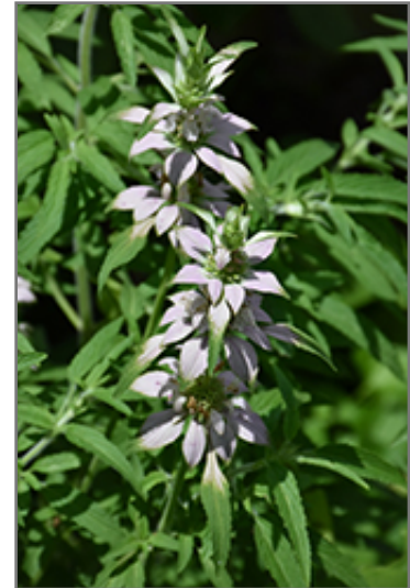
Spotted Beebalm flowers

This wildflower variety produces pretty clusters of yellow flowers with purple spots, surrounded by pinkish-purple leafy bracts; best in well drained, dry to medium sandy soil; needs good air circulation; great for massing along borders and naturalizing