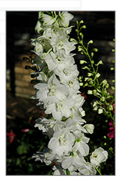
Pacific Giant Galahad Larkspur flowers