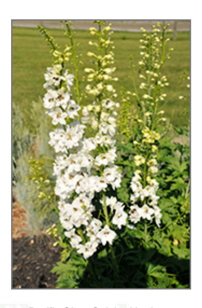
Pacific Giant Galahad Larkspur flowers

This plant will require occasional maintenance and upkeep, and should be cut back in late fall in preparation for winter. It is a good choice for attracting bees, butterflies and hummingbirds to your yard. Gardeners should be aware of the following characteristic(s) that may warrant special consideration;