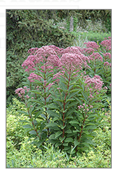
Joe Pye Weed in bloom

This is a relatively low maintenance plant, and is best cleaned up in early spring before it resumes active growth for the season. It is a good choice for attracting butterflies to your yard, but is not particularly attractive to deer who tend to leave it alone in favor of tastier treats. It has no significant negative characteristics.