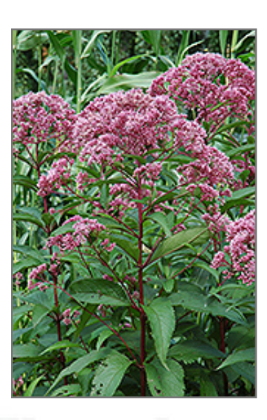
Joe Pye Weed flowers

A lovely upright perennial blooming in the summer and continuing into the fall; pretty rose colored flower plumes rise above dark green foliage; fast growing, great for woodland gardens, beds and containers; excellent for cut flower arrangements