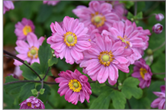
Pamina Anemone flowers

Pamina Anemone is recommended for the following landscape applications;