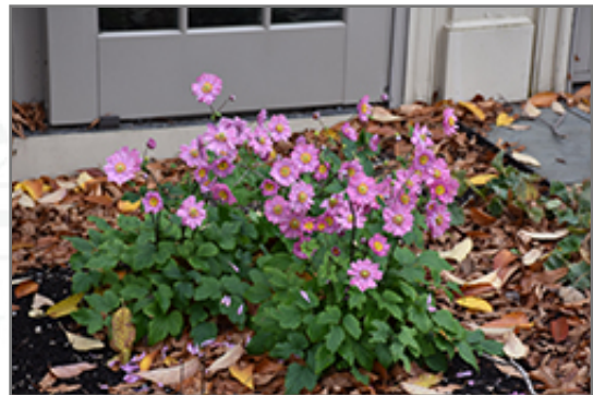
Pamina Anemone in bloom