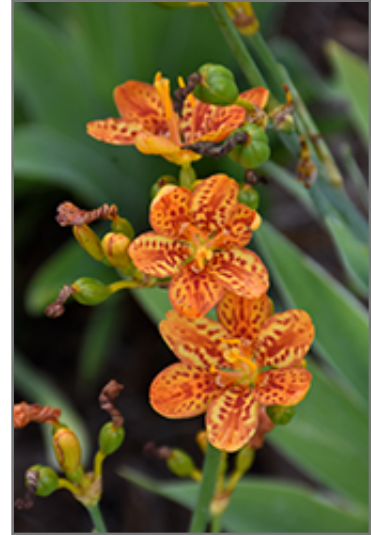
Freckle Face Blackberry Lily flowers

This is a relatively low maintenance plant, and is best cleaned up in early spring before it resumes active growth for the season. It is a good choice for attracting butterflies to your yard, but is not particularly attractive to deer who tend to leave it alone in favor of tastier treats. It has no significant negative characteristics.