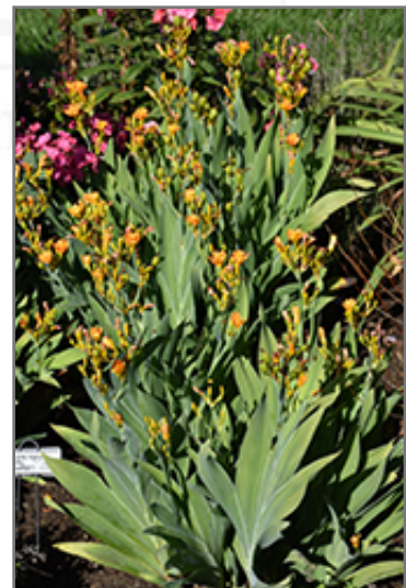
Freckle Face Blackberry Lily in bloom