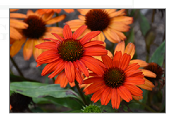
Kismet Intense Orange Coneflower flowers