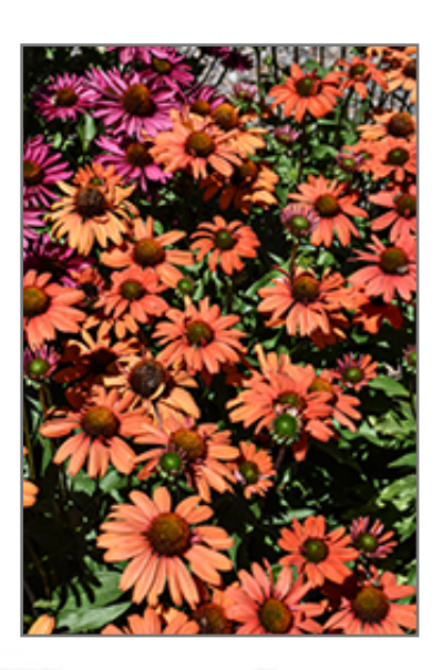
Kismet Intense Orange Coneflower flowers

Kismet Intense Orange Coneflower is an herbaceous perennial with an upright spreading habit of growth. Its medium texture blends into the garden, but can always be balanced by a couple of finer or coarser plants for an effective composition.