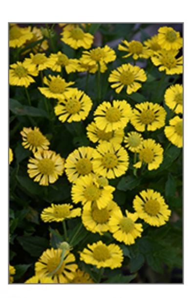
Mariachi Sombrero Sneezeweed flowers

A great summer and fall bloomer that brightens the garden with the sunniest of yellow blooms, when everything else starts to fade; adapts to most soils; regular watering needed