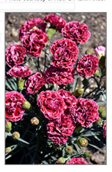
Fruit Punch Cherry Vanilla Pinks flowers