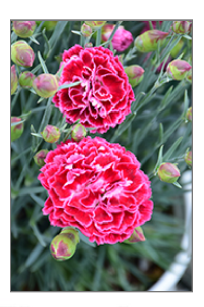
Fruit Punch Cherry Vanilla Pinks flowers

Fruit Punch Cherry Vanilla Pinks is an herbaceous evergreen perennial with a mounded form. It brings an extremely fine and delicate texture to the garden composition and should be used to full effect.