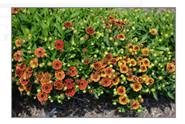
Mariachi Bandera Sneezeweed in bloom