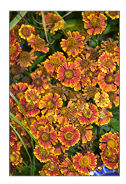
Mariachi Bandera Sneezeweed flowers

Mariachi Bandera Sneezeweed is an herbaceous perennial with an upright spreading habit of growth. Its medium texture blends into the garden, but can always be balanced by a couple of finer or coarser plants for an effective composition.