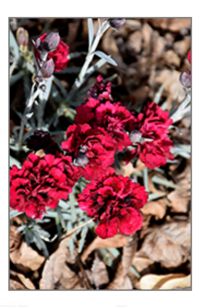
Odessa Red Pinks flowers

Impressive, frilly double flowers are deep crimson red with lighter red edges, above mounds of fine foliage; great for flower arrangements; deadhead to rebloom; pair up with summer blooming perennials and annuals to time a continued flower display