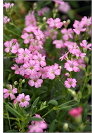
Filou Rose Creeping Baby's Breath flowers